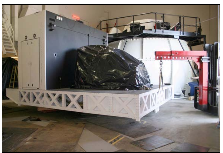
Transferring a Simulator