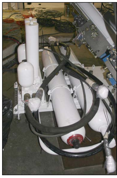
Preparing for a Simulator Move