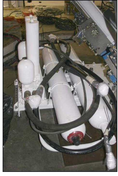
Preparing for a Simulator Move